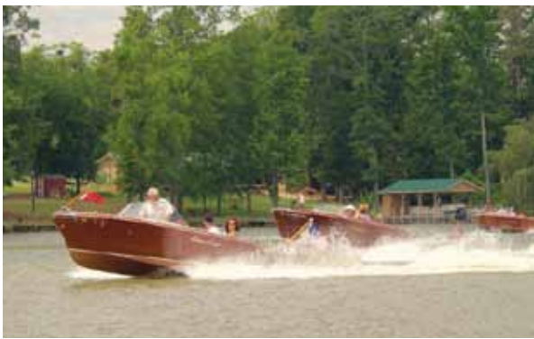
Cruising to the Neff Shop

Although boat shows are fun for the entire family, most avid boaters don't realize