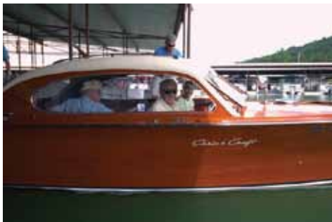
Riggles new ride

The 25th Annual Lake Chatuge Antique and Classic Boat Rendezvous has come and gone, and it has again proved to be what it originally started out to be — a lot of fun.