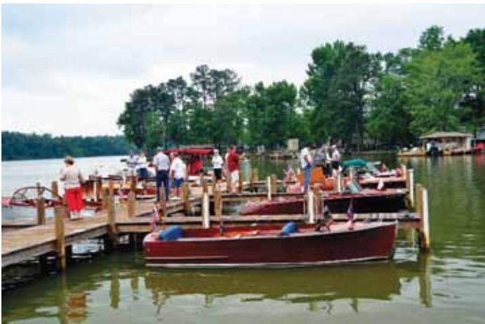
Admirers enjoying the woodies

We would like to give a big THANK YOU to everyone who helped us out by working the event or coming to support the show. We hope to see you again next year. 🍷