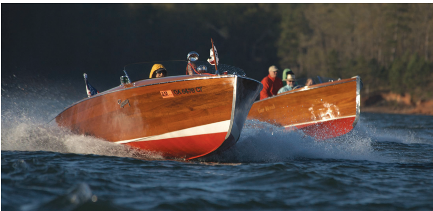
Dinner Run across Lake Hartwell to Portman Marina

Saturday morning, with 39 boats on display, the 20th Boat Festival opened with a beautiful warm day. Public attendance was steady, with a variety of attractions for the visitors. Again this year, the Porsche Club of the Carolinas and Peachstate exhibited more than 30 cars. The Southeast Modelers, with their remote-controlled boats, provided great entertainment for youngsters. Twelve boys and girls volunteered for Youth Judging, and several youth participated in the Build-a-Boat activity.