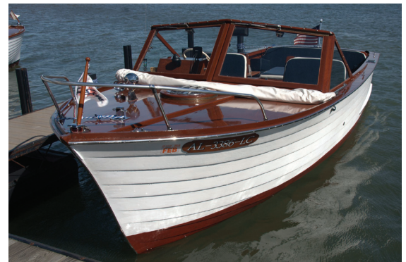
Scene Changes ready for public viewing