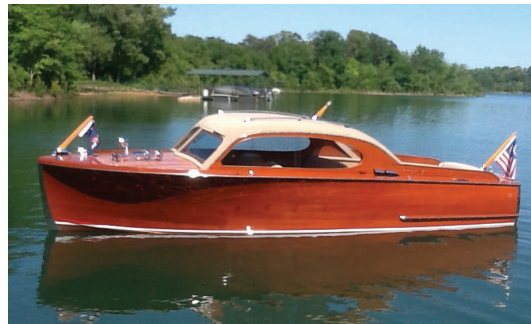
Best of Show, Gotcha Covered