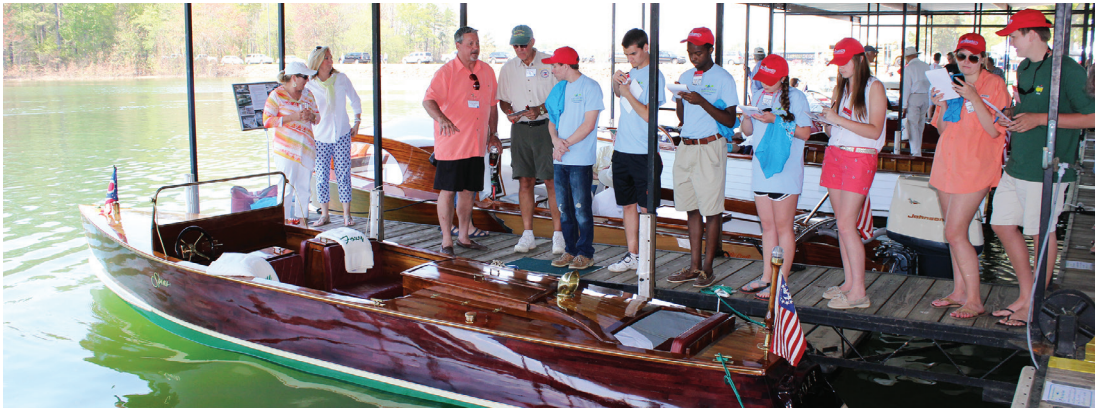
Youth judges on the job