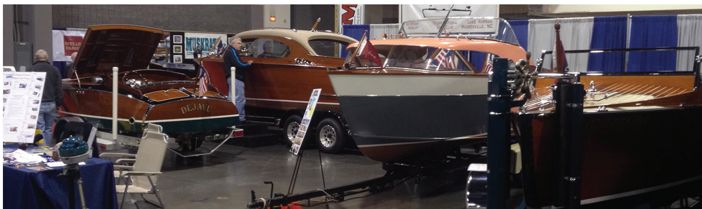
Old boats take stage at new boat show

Search: Blue Ridge Chapter ACBS | Like us: Click the "Like" button Updates will show up on your home page. You can post a comment and add a picture of your own boating experience!