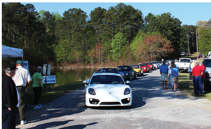
Porsches on parade

This year the Blue Ridge Chapter partnered with the Hart County Chamber of Commerce to take the Antique Wooden Boat Festival to another level. Local organizers prepared a series of events and activities directed toward entertaining the registered boaters, the Porsche Clubs of Georgia and Carolina geared up to return for the third year, and the Chamber recruited 30 craft vendors and an array of food merchants. Such excellent organization and the boost of perfect spring weather combined to deliver an event that surpassed expectations, with a record turnout estimated at more than 3,000 attendees.