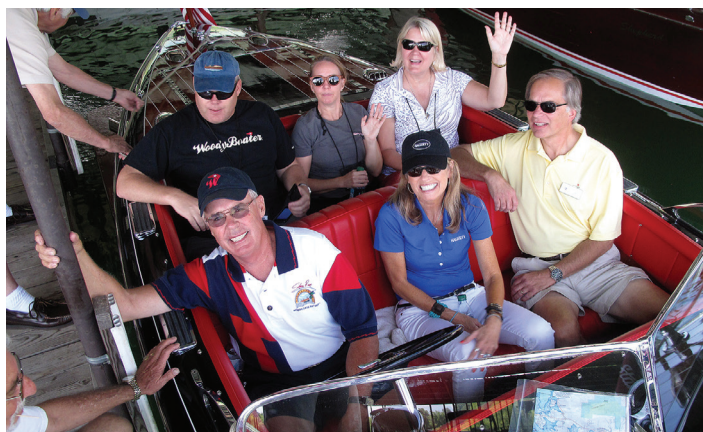
Visiting ACBS Directors returning from a cruise

Greetings, fellow boaters. WOW! Just WOW! What an amazing weekend we had at the 27 th Lake Chatuge Rendezvous. Boaters and Board members began arriving as early as Wednesday June 4 th , and by Thursday we were nearly in full swing. The weather was perfect, and the chance to meet the movers and shakers of the ACBS was great. What we discovered about the ACBS Board is that they are just as nice, warm and fun as the Blue Ridge Chapter members.